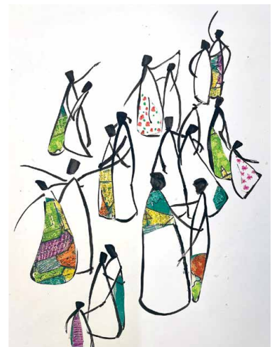
Celebration (Collage) and below: Italy apricots and black tomato

In my artwork I can't help but focus on life and joy, often little overlooked moment and include my obsession with food, drink, people and place, oh, and portraits. I have my work in galleries up and down the country and I have a large portfolio of card images and limited edition prints, this makes my work accessible and affordable.