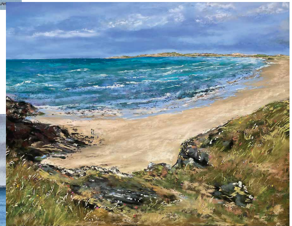
Sabina Aucock (Pastel) Malltraeth Bay, Anglesey