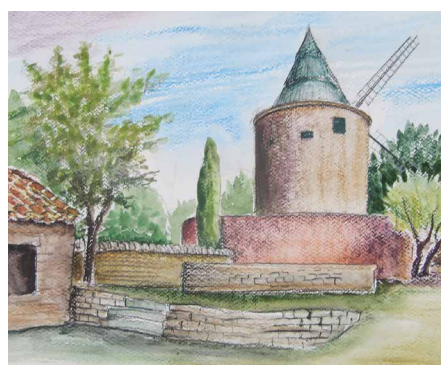
Hilary Broad. Provence (Watercolour pencil)