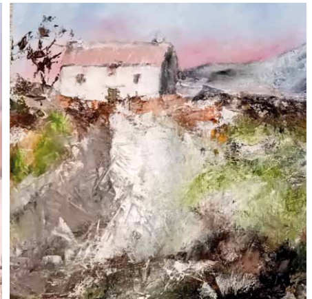
Phyl's delightfully loose Oil entitled "March"