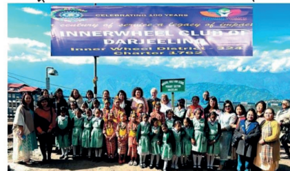
दार्जिलिंग (निज संवाददाता)। विद्युत् प्रेरित वर्षे दार्जिलिंग हजर बहौल विद्युत् परिवार के विद्यार्थी बच्चों को जर्नीकरण के अन्तर्गत बच्चों के लिये ट्वाय ट्रेन में करायी गयी ज्वाय राइड।

"In the News", one of the reasons I have to take a suit and tie. Each year the Darjeeling society sponsors an underprivileged school to a train ride with picnic, new school rucksack and a book. The event is timed to my visit so I can meet the children and teachers. It is a huge honour to be there.