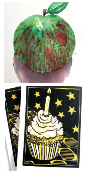
Brusho and Block Printing

We chose the simplicity of the fruit for this workshop as it allowed you to concentrate on the medium. I hope everyone enjoyed having a go at it. We certainly got a lot of different effects from those who tried. That's the beauty of Brusho, you never get the same result no matter how many times you repeat the exercise.