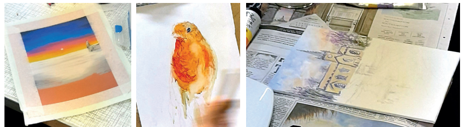
A few examples of lovely work in progress which developed beautifully. It as very productive evening.