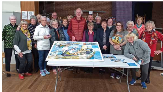
The 'Team' on Friday 28 April (Our last Meeting at Ulverston Road).