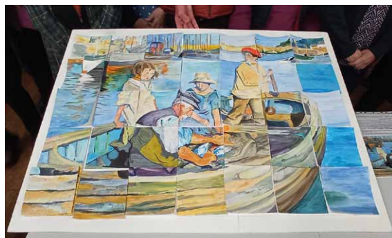
THE FISHERMAN'S EXPEDITION by Stanhope Forbes (1857 - 1947)

(The Fisherman's Expedition last sold at Christie's in 2013 for £170 500)