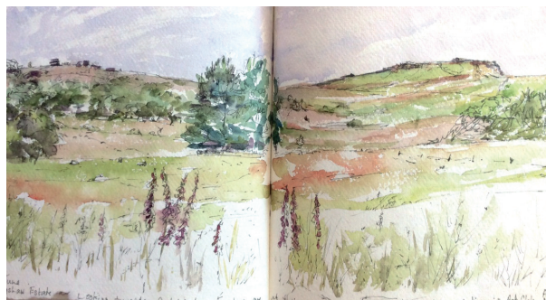
Sabina's delightful watercolour sketch