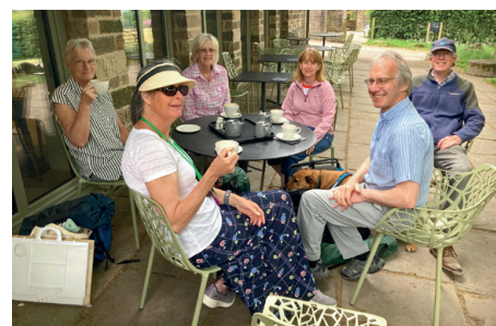
Longshaw; No painting yet!

Everyone enjoyed the day, despite the unpredictable weather. The advice for next time would be to pack for every eventuality!